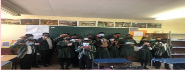
PICTURED: THE GRADE 7 LEARNERS WITH THEIR MUGS